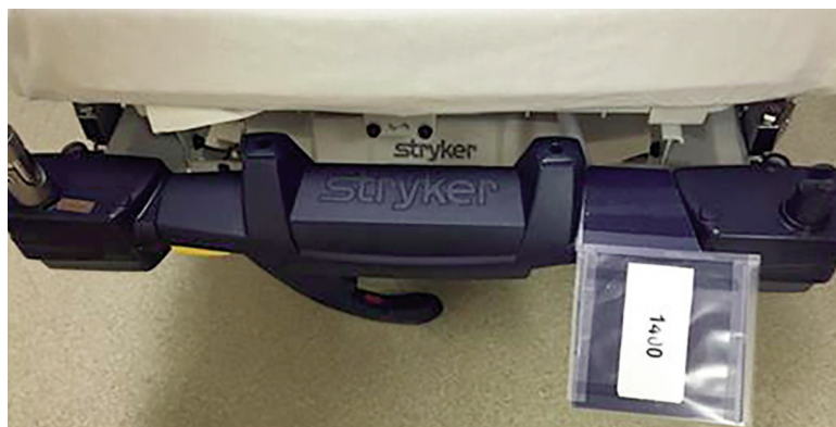
Left: Flex labels monitor laptops and other office equipment. Above: Alien Technology ALN-9728 tags identify beds.